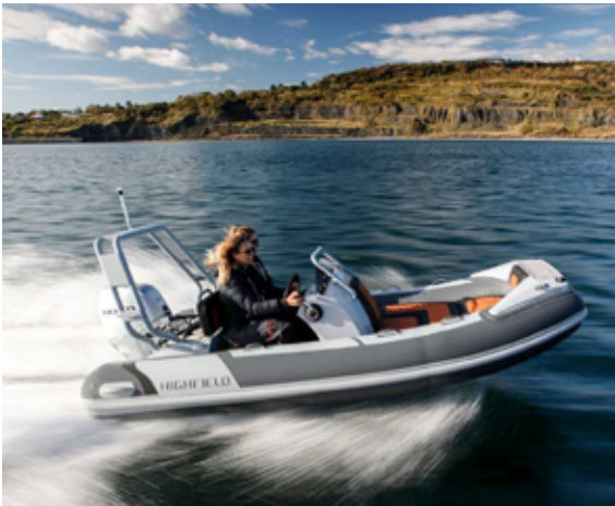
SPORT 390 with optional roll bar

Brushed EVA teak flooring, internal LED convenience lighting, recessed cleats & high quality upholstery set this range apart from the competition. Roll bars with mounted stern lights or rear tow posts and removable sun deck cushions available as options.