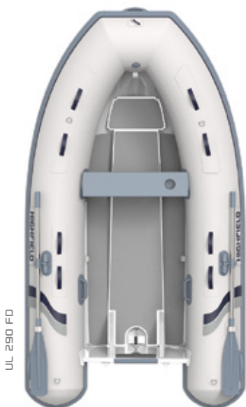
UL 290 FD

* SS = Space Saver design with 15" tube diameter and narrower beam † LT = Large Tube, with 17" tube diameter