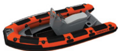
PATROL 460 w/jockey console

The PATROL series offers a range of customizable cockpit layouts, giving you a number of options for what kinds of seating and steering set-up you want, ideal for yacht club chase boats, expedition operators, or private owners looking for the ultimate in a big, powerful RIB.