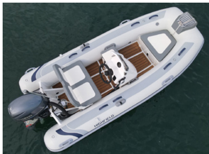
CLASSIC 360 with GT PACKAGE