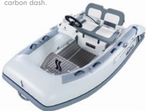
CLASSIC 310 with FCT-7

Designed to fit the CL 290 thru 380, the FCT-7 console is an all-in-one seating and steering approach, with built-in navigation lights and switches and new carbon dash.